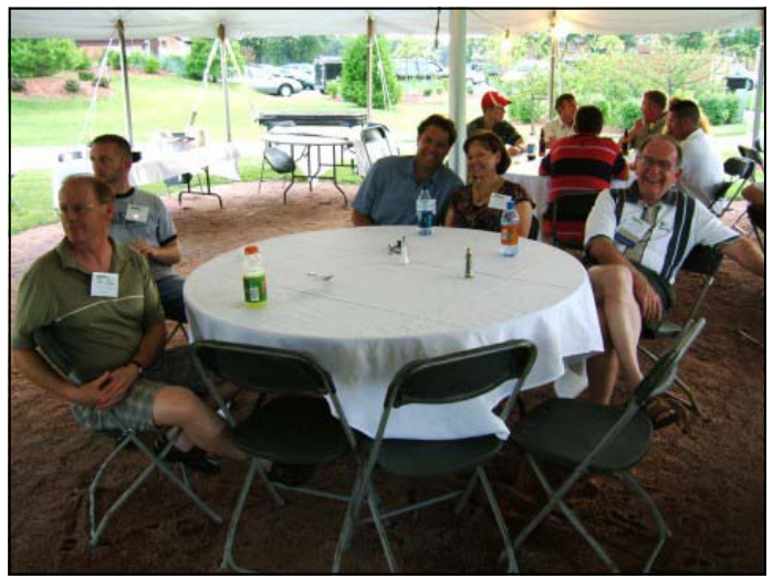
Precasters, their families and suppliers enjoyed time socializing after dinner on Friday night. Thankfully, the weather cooperated for the outside dinner and entertainment.