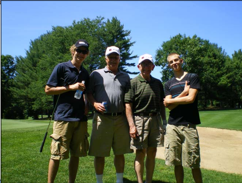
Golfers enjoy the course at Chula Vista Resort in Wisconsin Dells, Wis., on July 11, 2009.